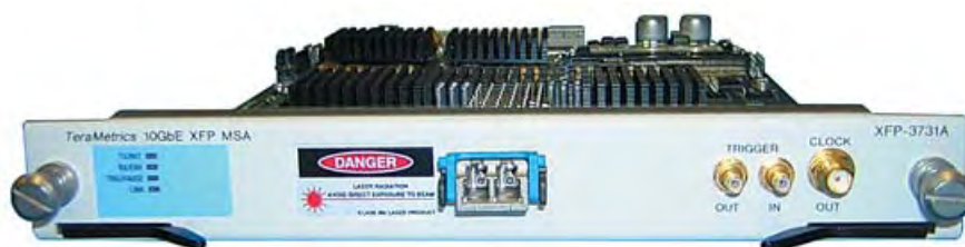
SmartBits XFP-3731A module

Both SmartBits 10GbE XFP-MSA-based test modules are used to measure the performance and test the interoperability of IPv4 and IPv6 networking devices. All SmartBits 10-Gigabit Ethernet test modules are compliant with the IEEE 802.3ae standard.